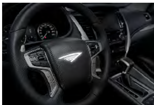
Steering Wheel Emblems