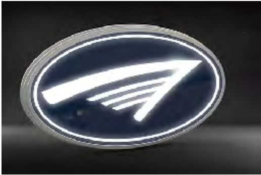
Light Through White