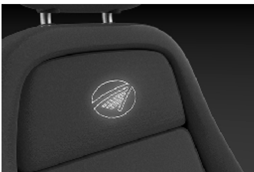
Lighting Through Perforations